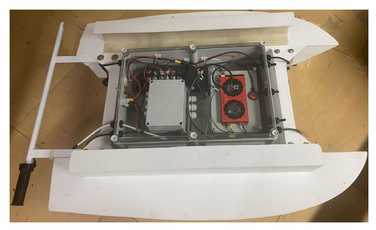
Fig 3: USV

UUV : The UUV is the iBubble Evo. This is an untethered drone with seven thrusters, an endurance of one hour, and a maximum operating depth of 60 m. The iBubble has a proprietary sonar positioning system. This is capable of tracking a diver by using four hydrophones to pick up the acoustic signal transmitted by a remote controller worn by the diver. The iBubble can also detect and avoid obstacles by means of an integrated visible light camera module. As in the case of the UAV, additional electronic components were added to the iBubble. A Water Linked M64 acoustic modem relays warning messages from the USV to an Arduino Mega 2560 microcontroller which, in turn, turns on an LED indicator to warn the diver in the event of marine traffic.