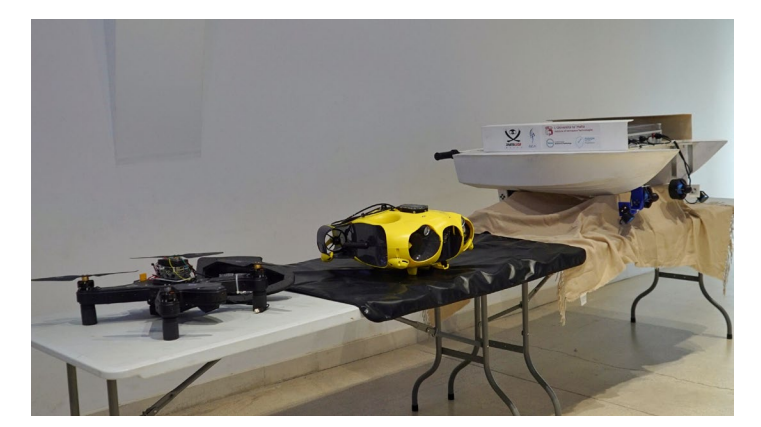
Fig 4: BEA system with Cutacopter, iBubble EVO, Buoy (from left to right)