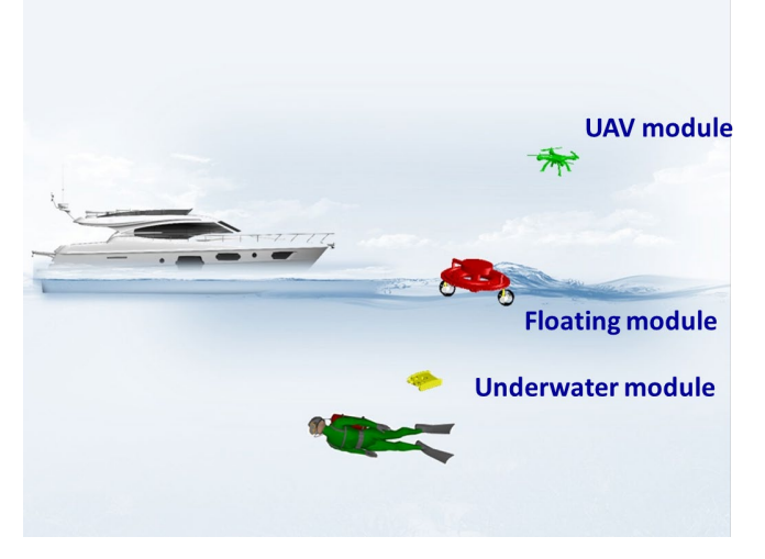
Fig 1: BEA system concept

Figure 2 shows the 3D model of the finalized conceptual design.